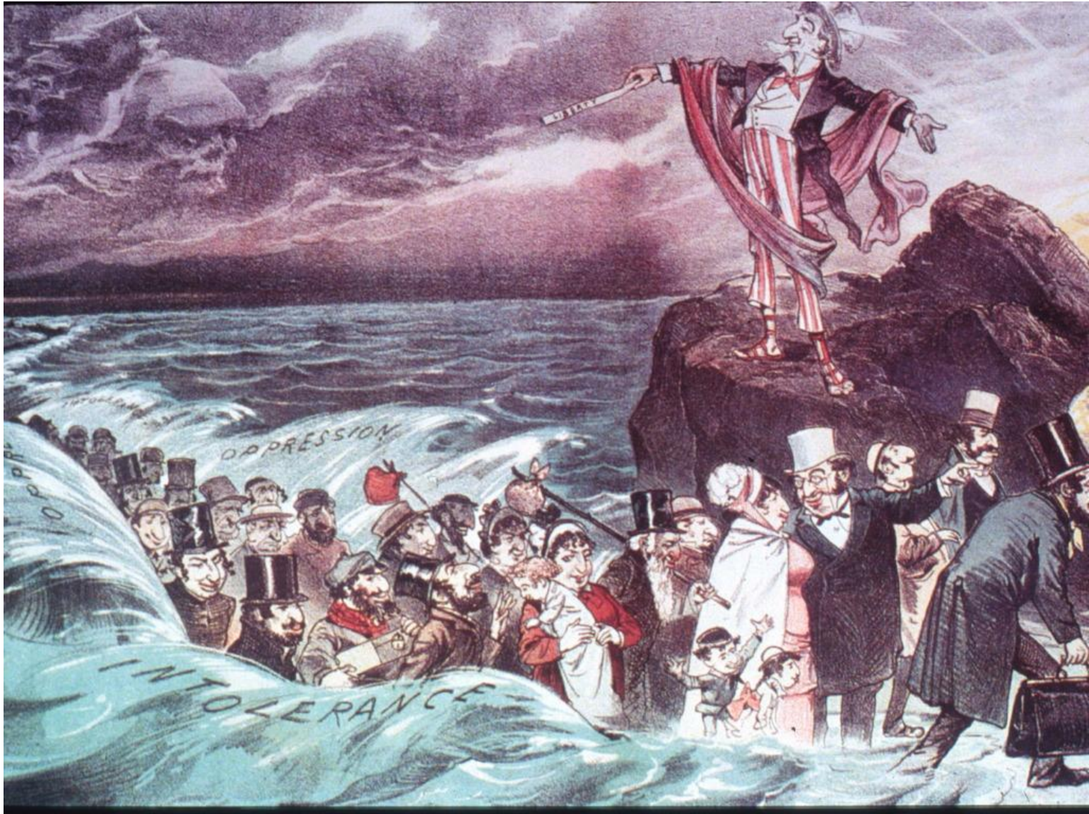
Parting the waters for Europe's Refugees