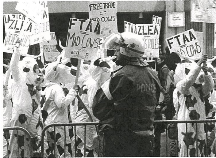
▲ In Montreal, Canada, on March 29, 2001, protesters demonstrate at a summit on globalization and the Free Trade Area of the Americas (FTAA).

In the 1990s, U.S. businesses frequently moved their operations to less economically advanced countries, such as Mexico, where wages were lower. After the passage of NAFTA, more than 100,000 low-wage jobs were lost in U.S. manufacturing industries such as apparel, auto parts, and electronics. Also, competition with foreign companies caused many U.S. companies to maintain low wages.