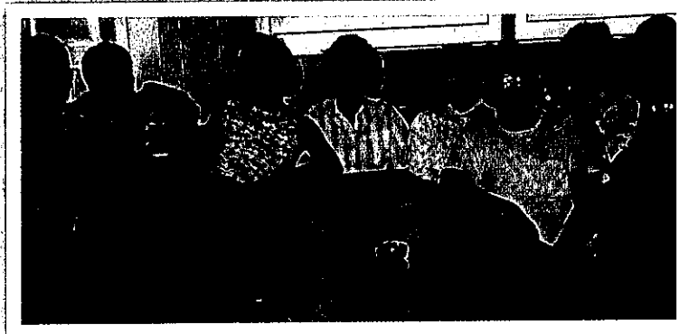
▲ Workers at the John Roberts clothing factory