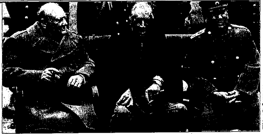
The three Allied leaders – Winston Churchill, Franklin Roosevelt, and Joseph Stalin (left to right) – sit for photographers at the Yalta Conference, February 1945. FDR died two months later.

The chief Allied leaders (Franklin Roosevelt, Winston Churchill, and Joseph Stalin) met in the Crimean resort city of Yalta (in the Soviet Union) in February 1945. Roosevelt and Churchill agreed to recognize pro-Soviet governments in each of the